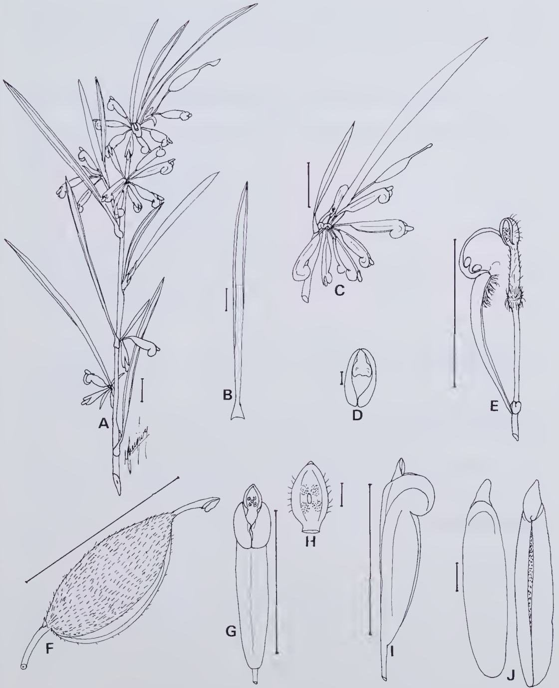
Figure 2. Grevillea bronwenae Keighery. A - Habit. B - Leaf. C - Inflorescence. D - Top view of flower. E - Lateral section of flower. F - Fruit. G - Front view of flower. H - Pollen presenter. I - Side view of flower. J - Seed. A-E, G, H, I B.J. & G.J. Keighery s.n. (holo: PERTH). F, J G.J. Keighery 9471. Scale bar = 10 mm, except D, H, J = 1 mm.